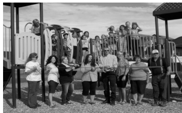
Council/ Parks Committee and Children taking part in the ribbon cutting

The Grand Opening Ceremony of Whitetail Crossing playground could not have been met with better weather.