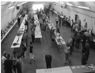
2016 Bench show

Photography- 1 st - Jamie Perlik(Mundare), 2 nd - Andy Kozicki (Vegreville), 3 rd -Charlotte Hrynyk(Vegreville)