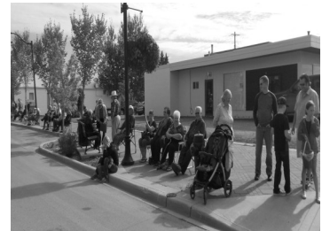
Mundare parade and bounce house

three fun bouncy houses for the kids to play on as well as cooling off in the spray park. It was so nice to have an ice cream vender come and set up out side for everyone to have a nice cool treat. Inside the MRC the entries from the bench show were on exhibit. Thank You to the Ag society for another great weekend.